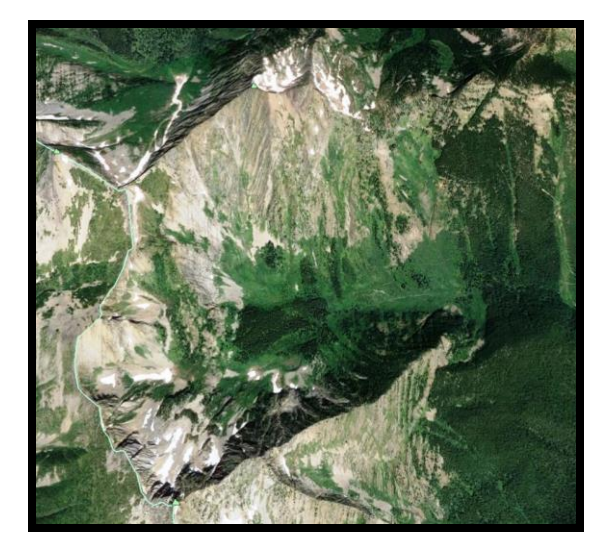
Glacial Cirque Headwaters of the West Fisher River-

CLOSURES : Motorized use is allowed to the trailhead, but not beyond the gate.