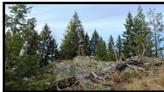
Teeters Historic Lookout Site

Prepared by Cabinet Back Country Horsemen