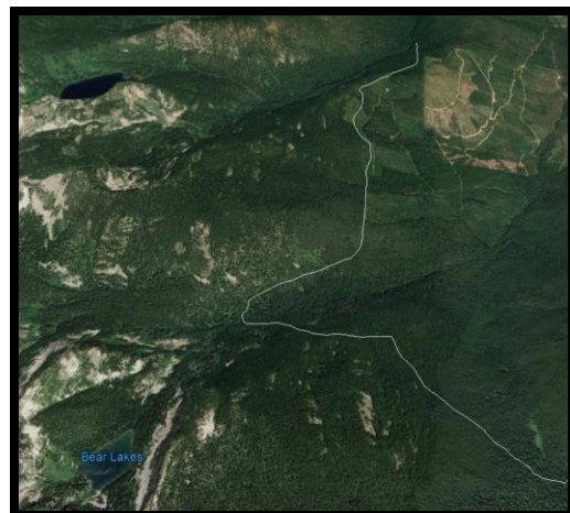
Silver Dollar Trail

MAPS: Forest Map, District Travel Map CLOSURES: All motorized use