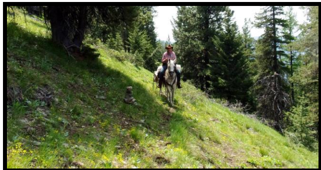
Porcupine Ridge Trail