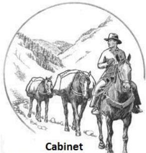
Cabinet Back Country Horsemen