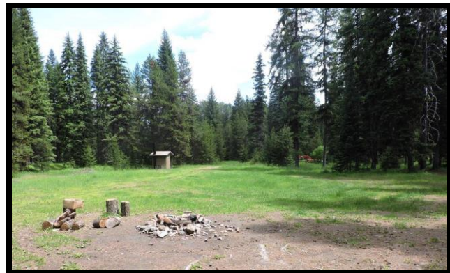
Large Opening & Vault Toilet