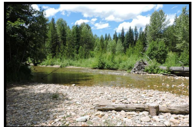
West Fisher River

Prepared by Cabinet Back Country Horsemen