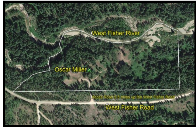
Camp Site Map