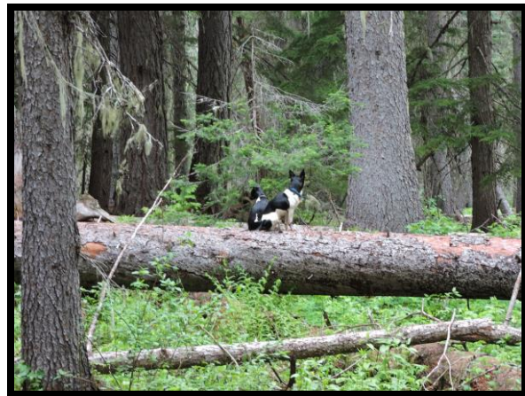
Old Growth Forest