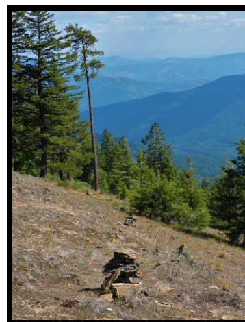
Upper Trailhead at Libby Divide