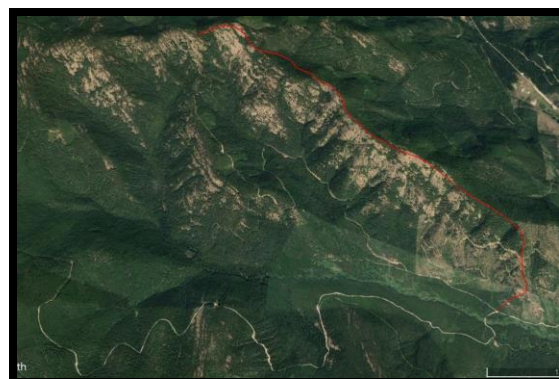
Miller Creek Drainage