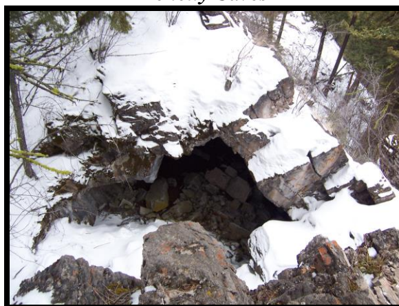
Kenelty Cave Opening

Prepared by Cabinet Back Country Horsemen