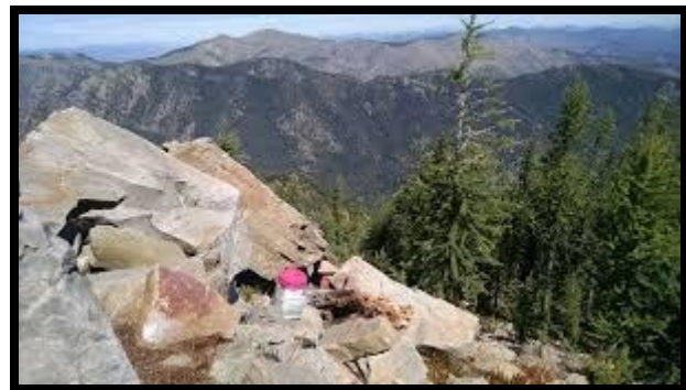
Indian Head Mountain

Prepared by Cabinet Back Country Horsemen