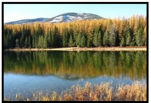
Howard Lake in the Fall

Prepared by Cabinet Back Country Horsemen