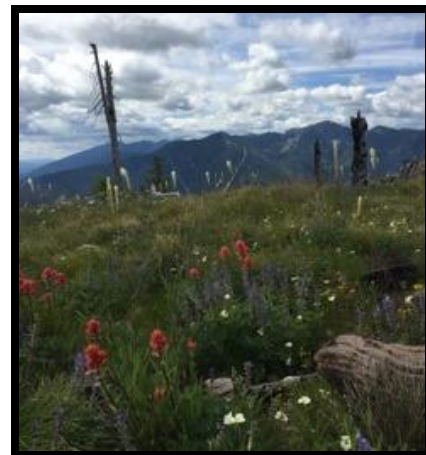
Flagstaff Mountain Trail

Prepared by Cabinet Back Country Horsemen and Libby Chamber of Commerce