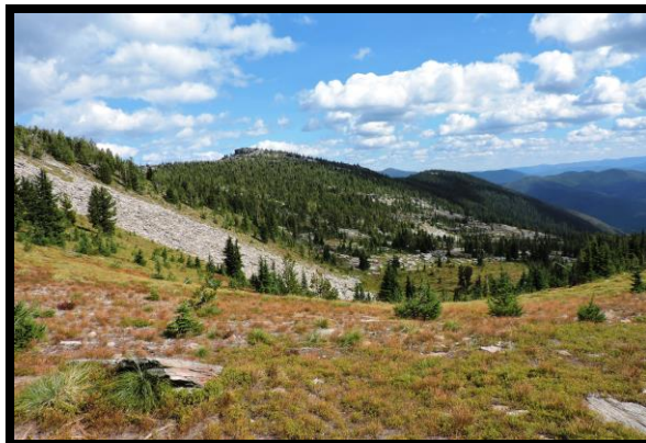
Bear Lakes Basin

Prepared by Cabinet Back Country Horsemen