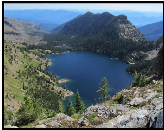
Upper Cedar Lake

Prepared by Cabinet Back Country Horsemen