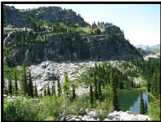
Bear Lakes

CLOSURES: All motorized use. Stock not allowed within 200' of Lakes