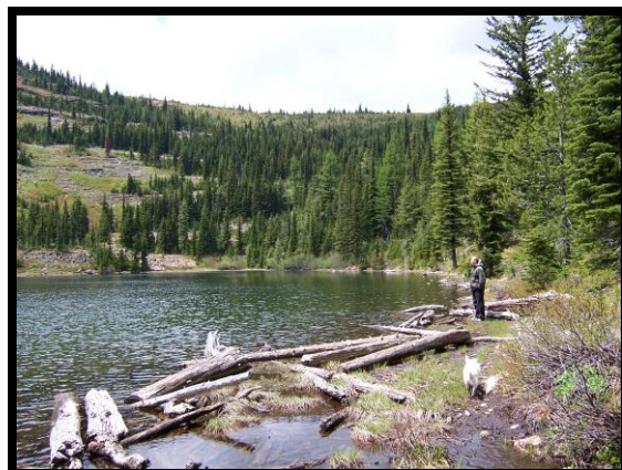
North Shore Baree Lake

CLOSURES: All motorized use. Stock not allowed within 200' of Lakes.