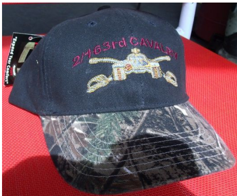
Cap # 1

The first selection is black with green camo bill with gun metal gray tank.