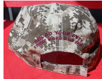
Cap # 3 - Digital Brown