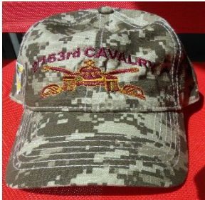
Cap # 2 - Digital Green